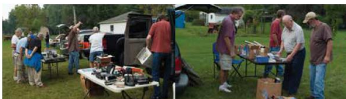
Reminiscing back to when tailgates were tailgates.